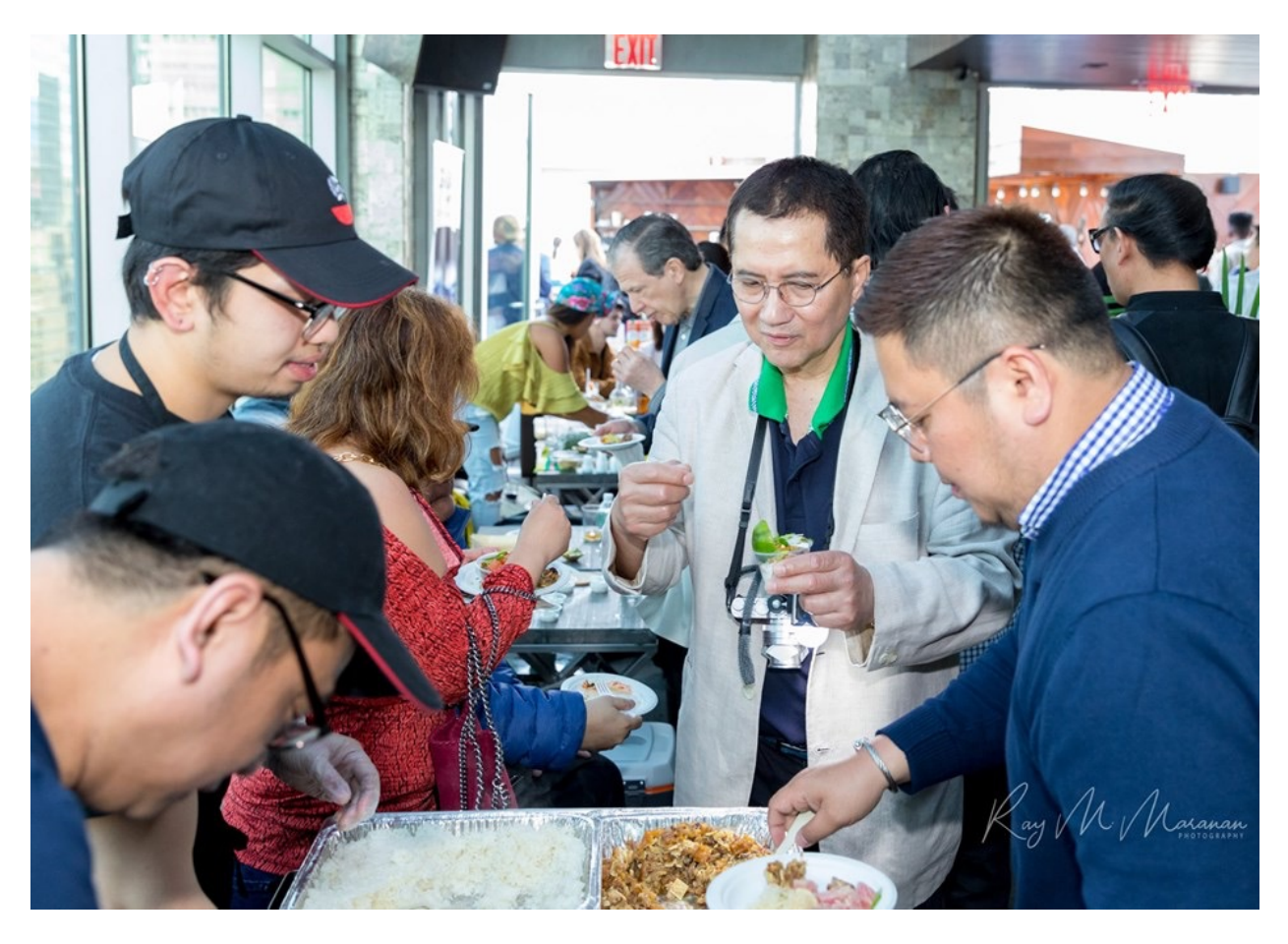
Guests enjoying Filipino food during the launch of the FRW 2019