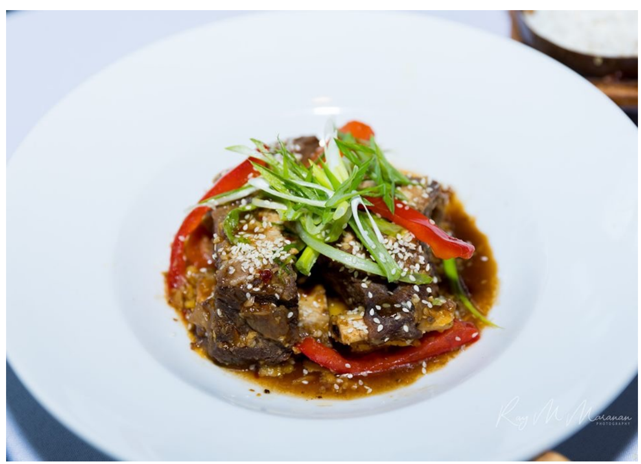
Food sampler prepared by the FRW 2019 participating restaurants.