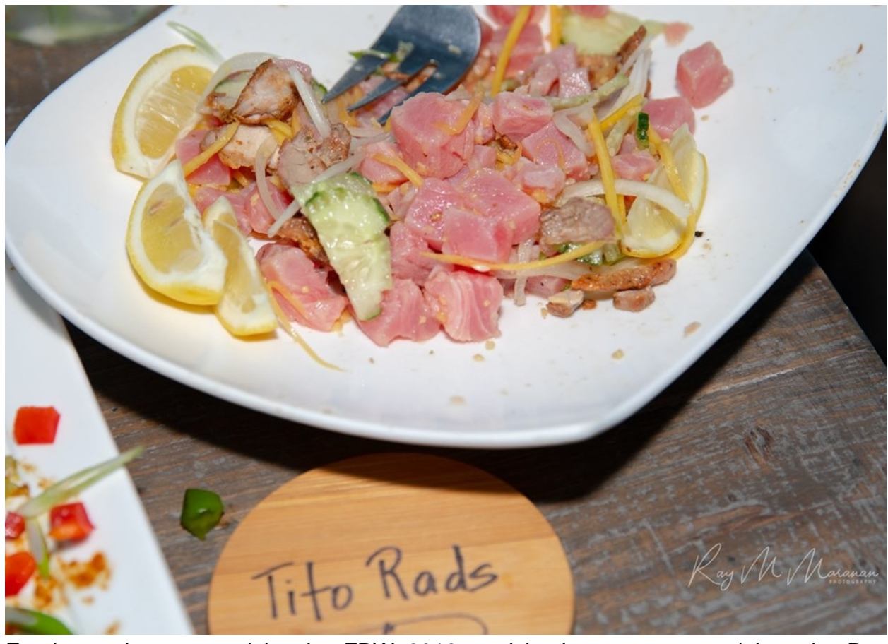
Food sampler prepared by the FRW 2019 participating restaurants.