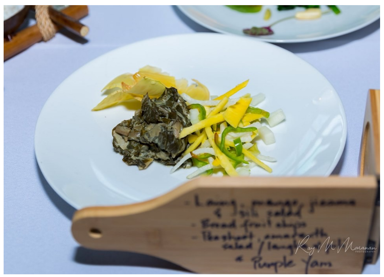
Food sampler prepared by the FRW 2019 participating restaurants.