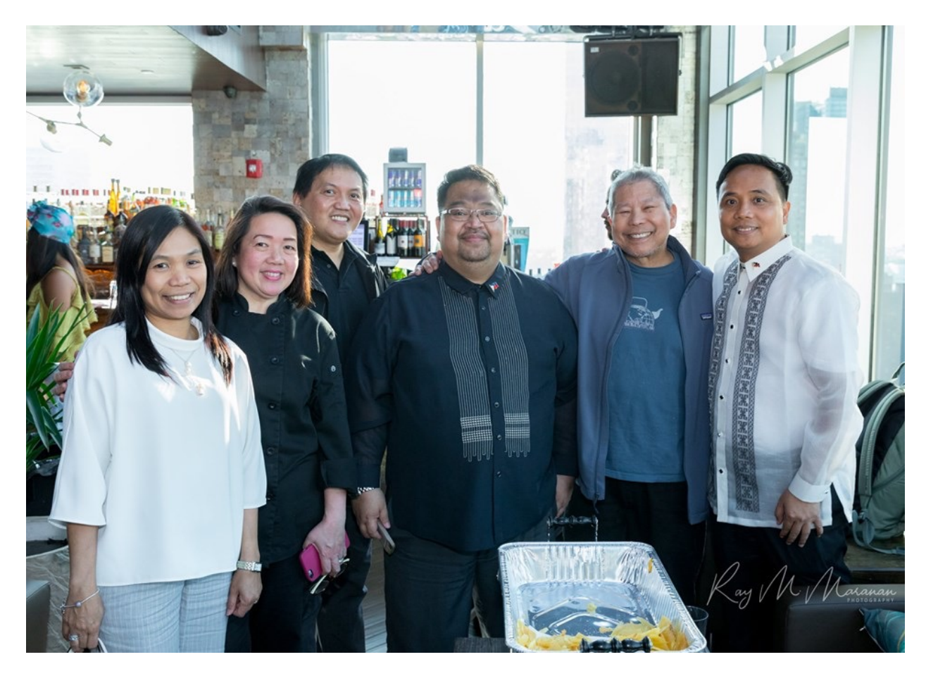
Consulate officials with some of the chefs of the participating restaurants.