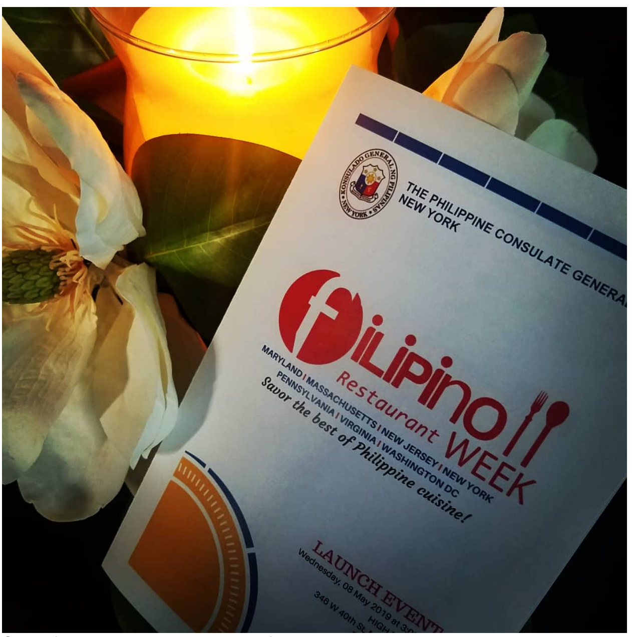
Copy of the Invitation to the Launch of FRW 2019.