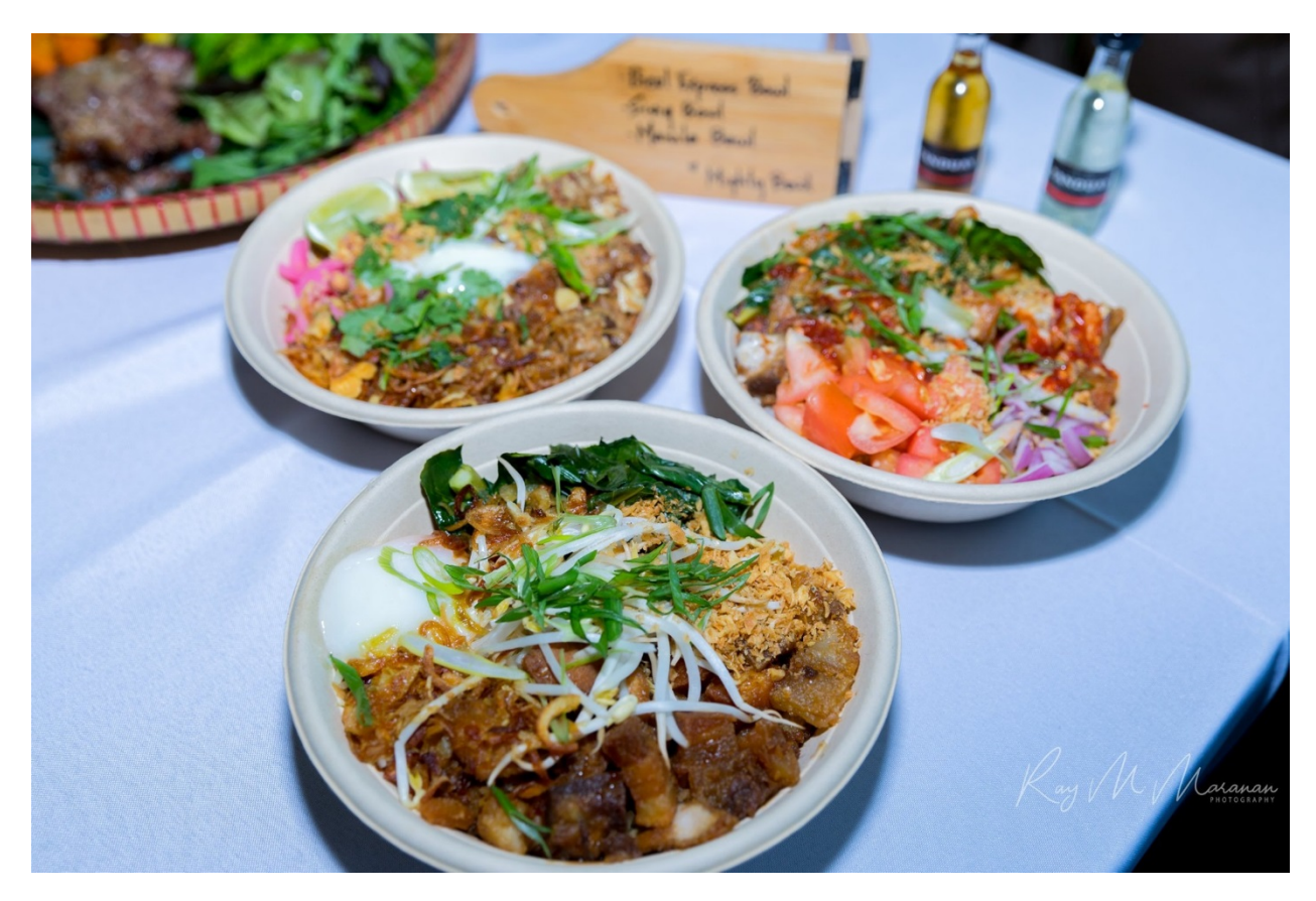
Food sampler prepared by the FRW 2019 participating restaurants.