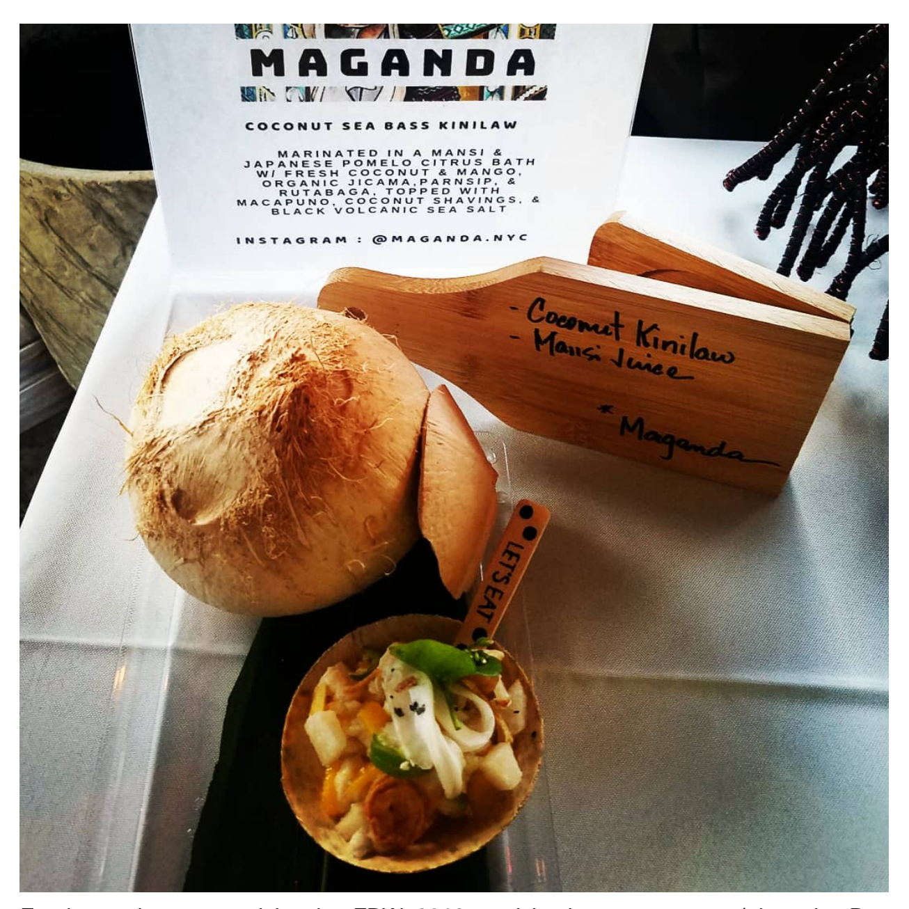
Food sampler prepared by the FRW 2019 participating restaurants.