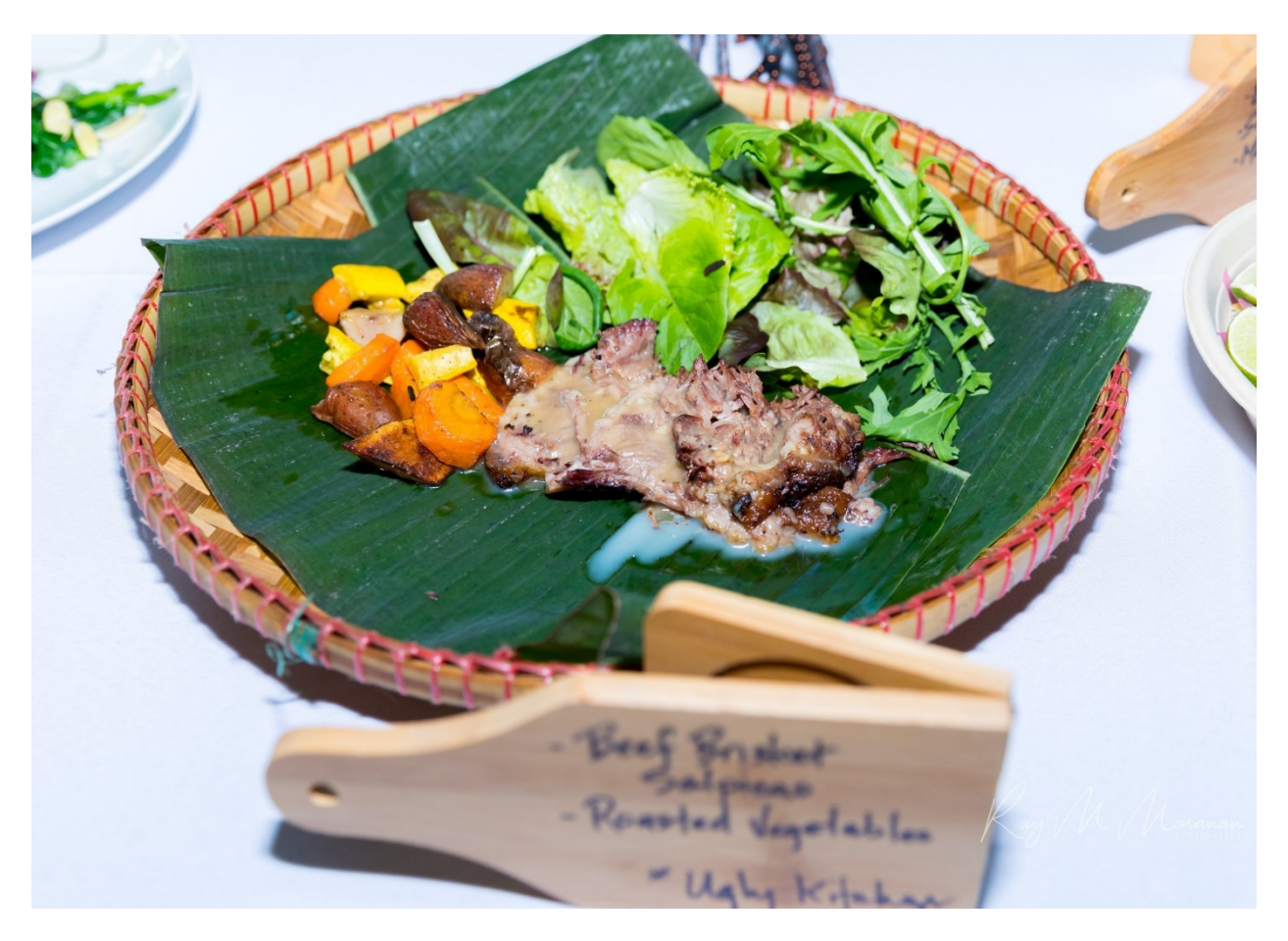
Food sampler prepared by the FRW 2019 participating restaurants.