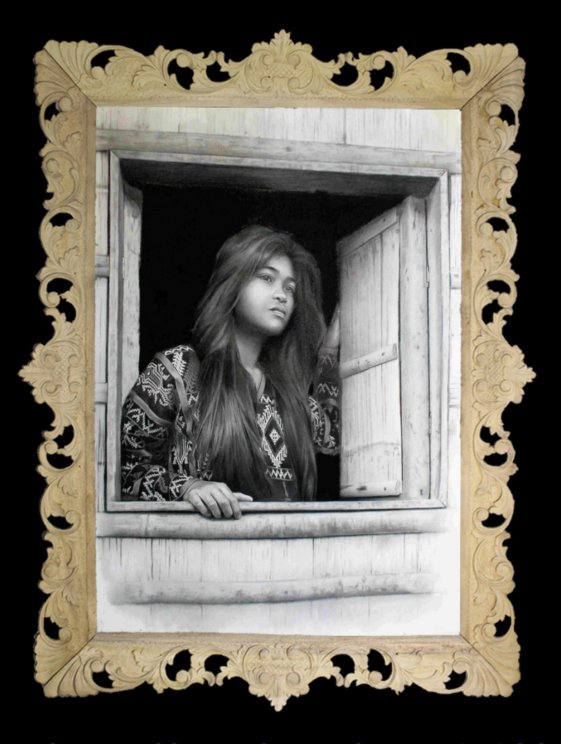
DalagangT'nalaknasabintana ng bahaykubo.