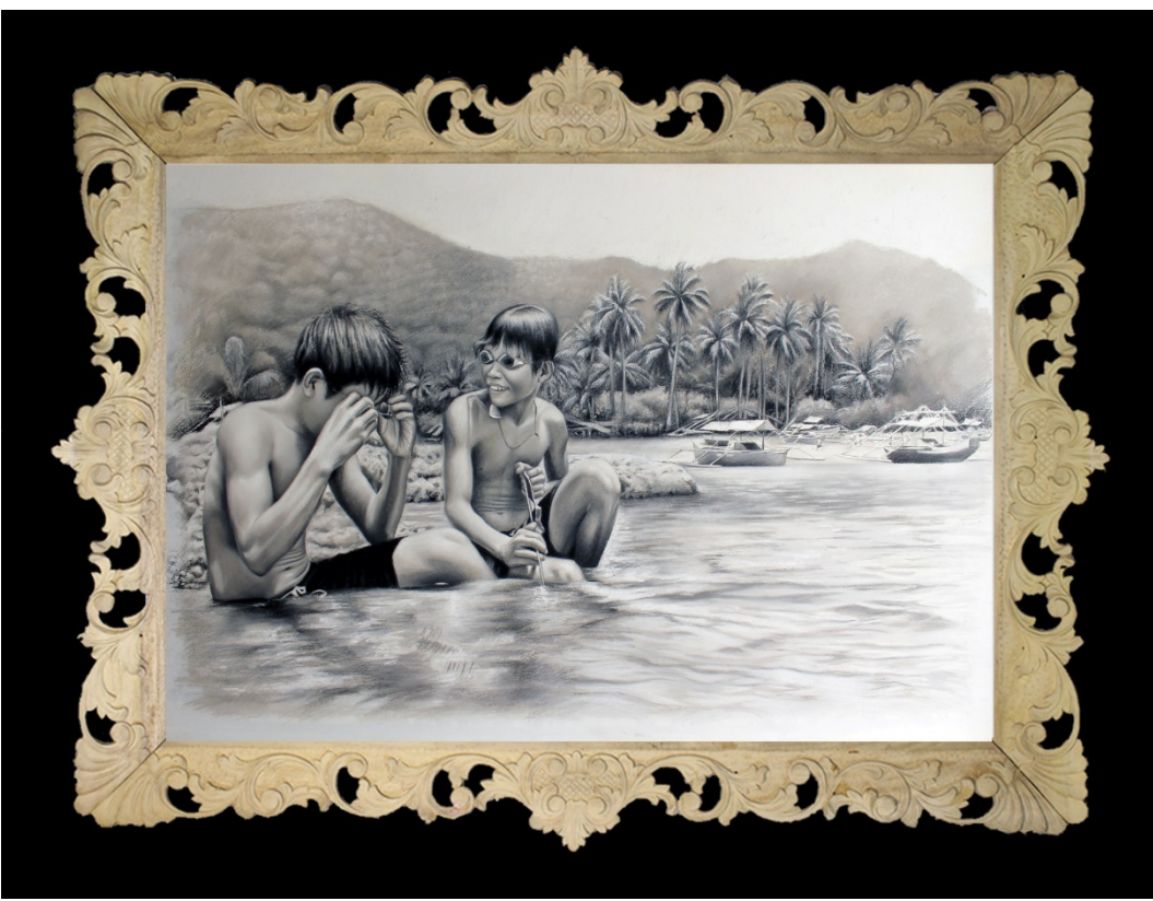
Mga katutubong bata na nagsisibat pangingisda sa Dibut dagat-dagatan.Probinsya ng Aurora.

The exhibit will run until 11 October 2019. END.