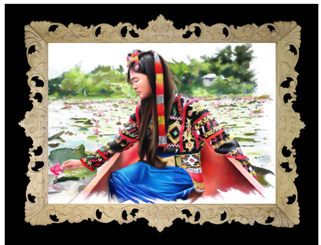
DalagangT'bolisa Lake Sebu. Probinsya ng South Cotabato.