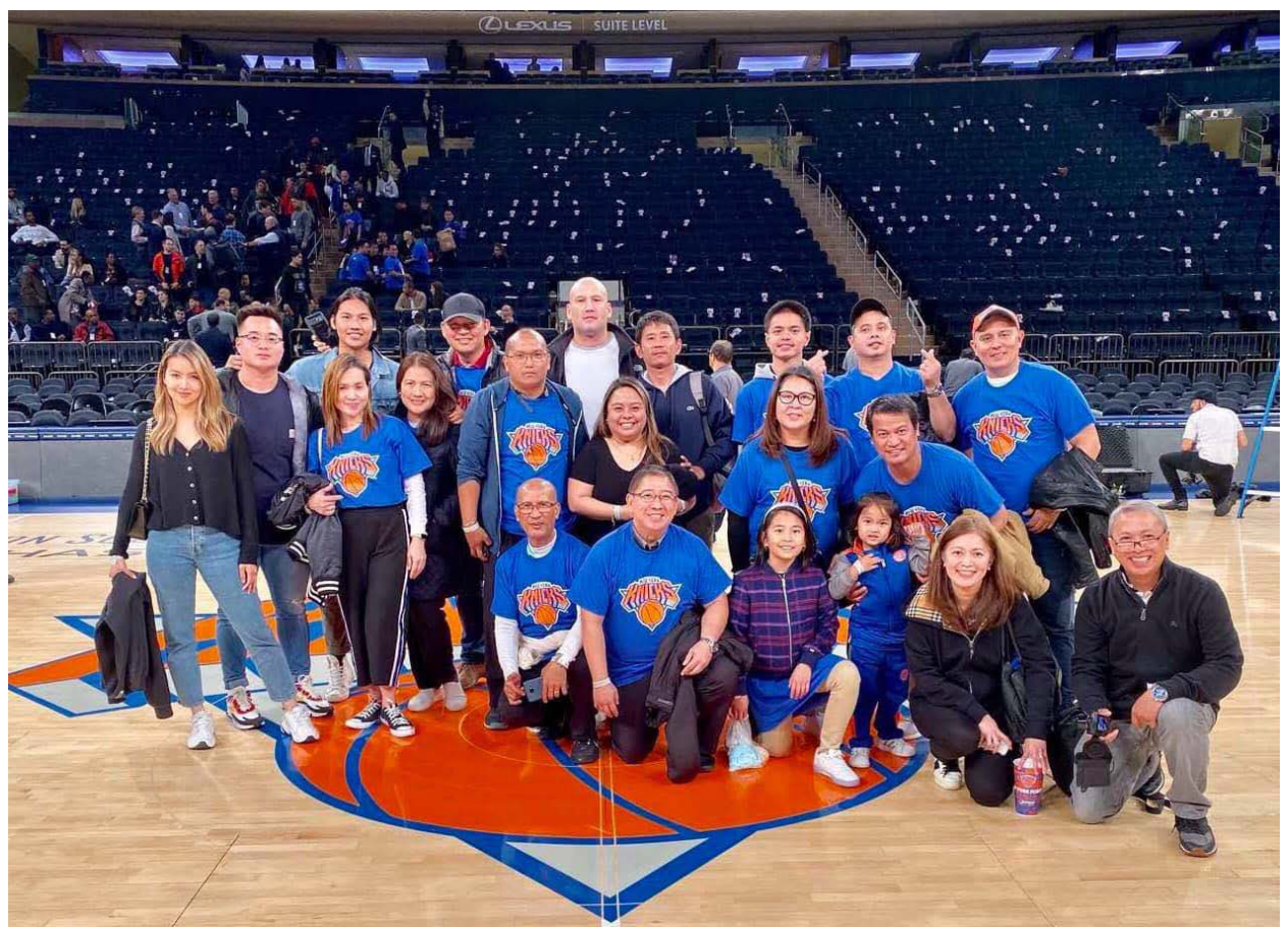
Philippine Consulate NY staff and family post-game photo op.