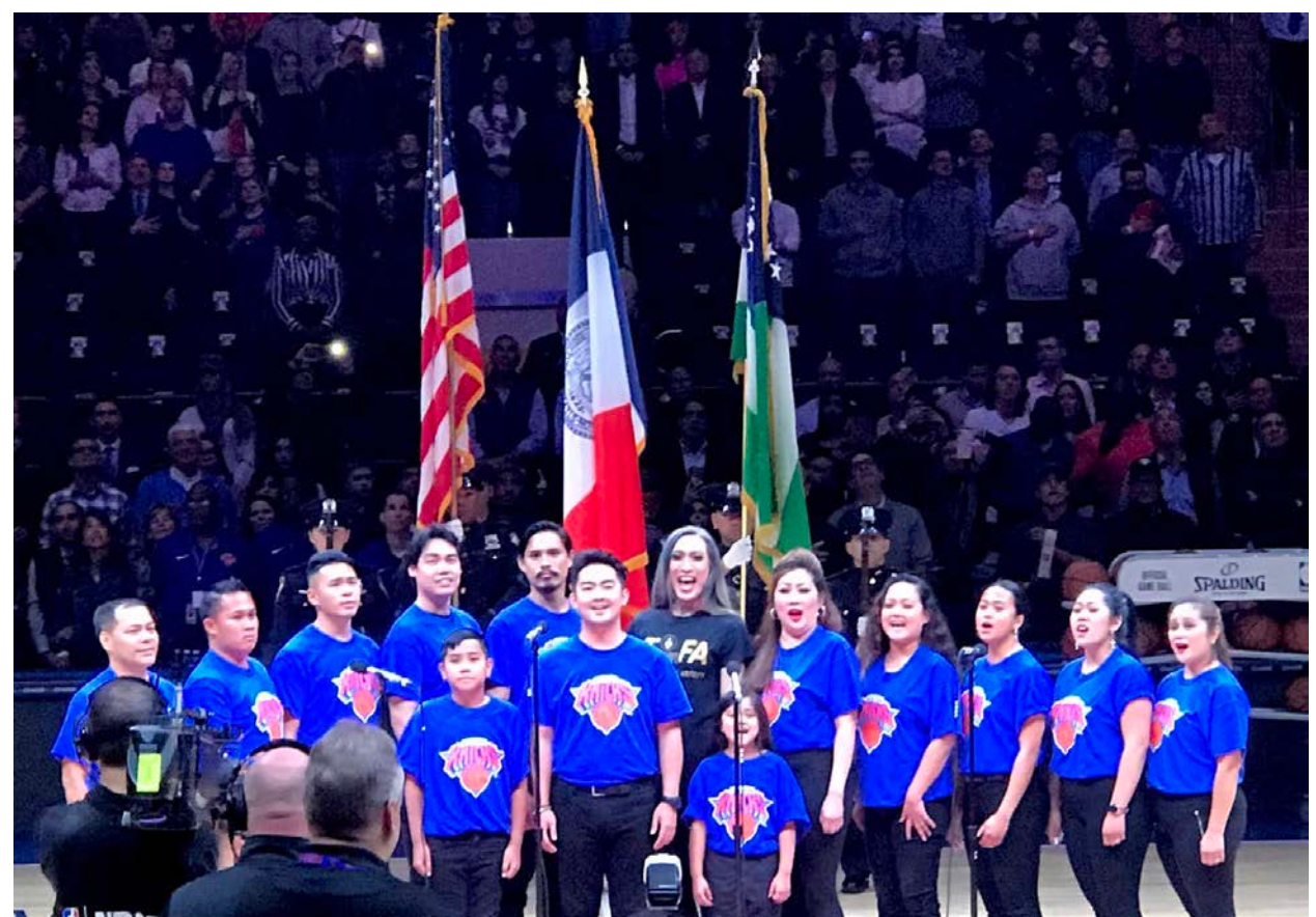
TOFA artists sing the National Anthem during the Filipino Night with the Knicks.