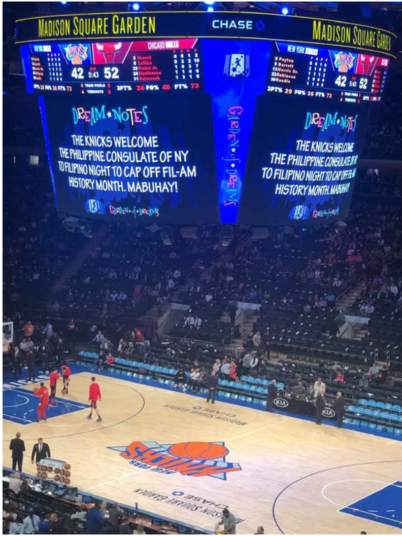
Messages & greetings to Philippine Consulate NY and other Fil-Am organizations displayed on GardenVision during halftime.

Another Filipino Heritage Night with the Brooklyn Nets is set to happen on 1 December 2019 at Barclays Center New York. - END