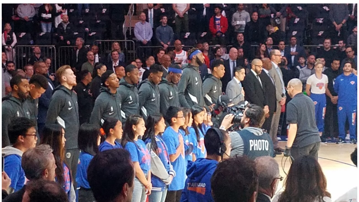
Fil-Am kids stand in front of NY Knicks players during the National Anthem.