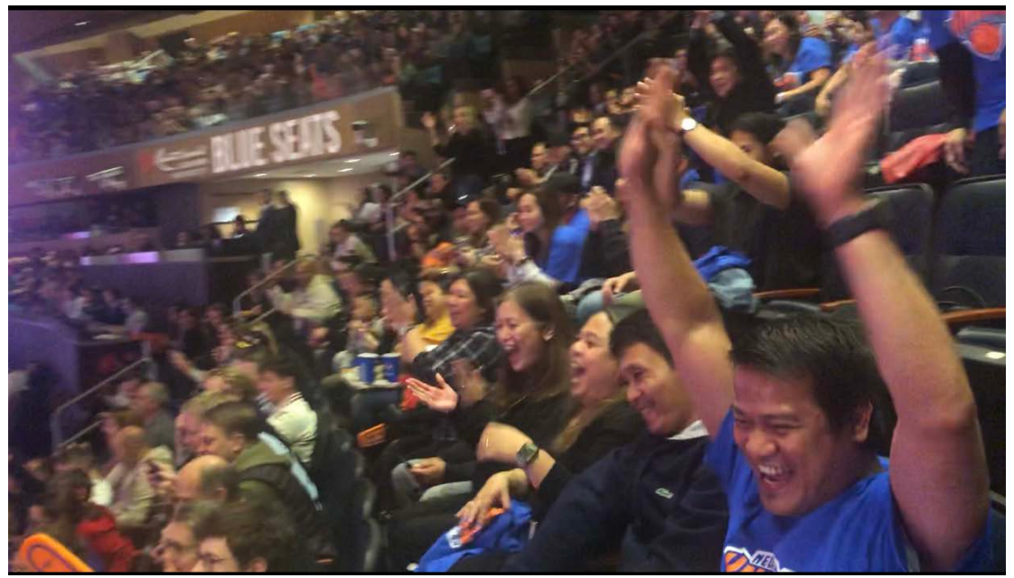
Filipinos in uproar as New York Knicks won 105-98 against Chicago Bulls during Filipino Night at MSG.

29 October 2019, New York City. – Around 800 Filipino and Filipino-Americans from New York, New Jersey, Pennsylvania and Connecticut went to the iconic Madison Square Garden to cheer for the New York Knicks as it took on Chicago Bulls on 28 October 2019 in a game billed as Filipino Night in celebration of Filipino American History Month.