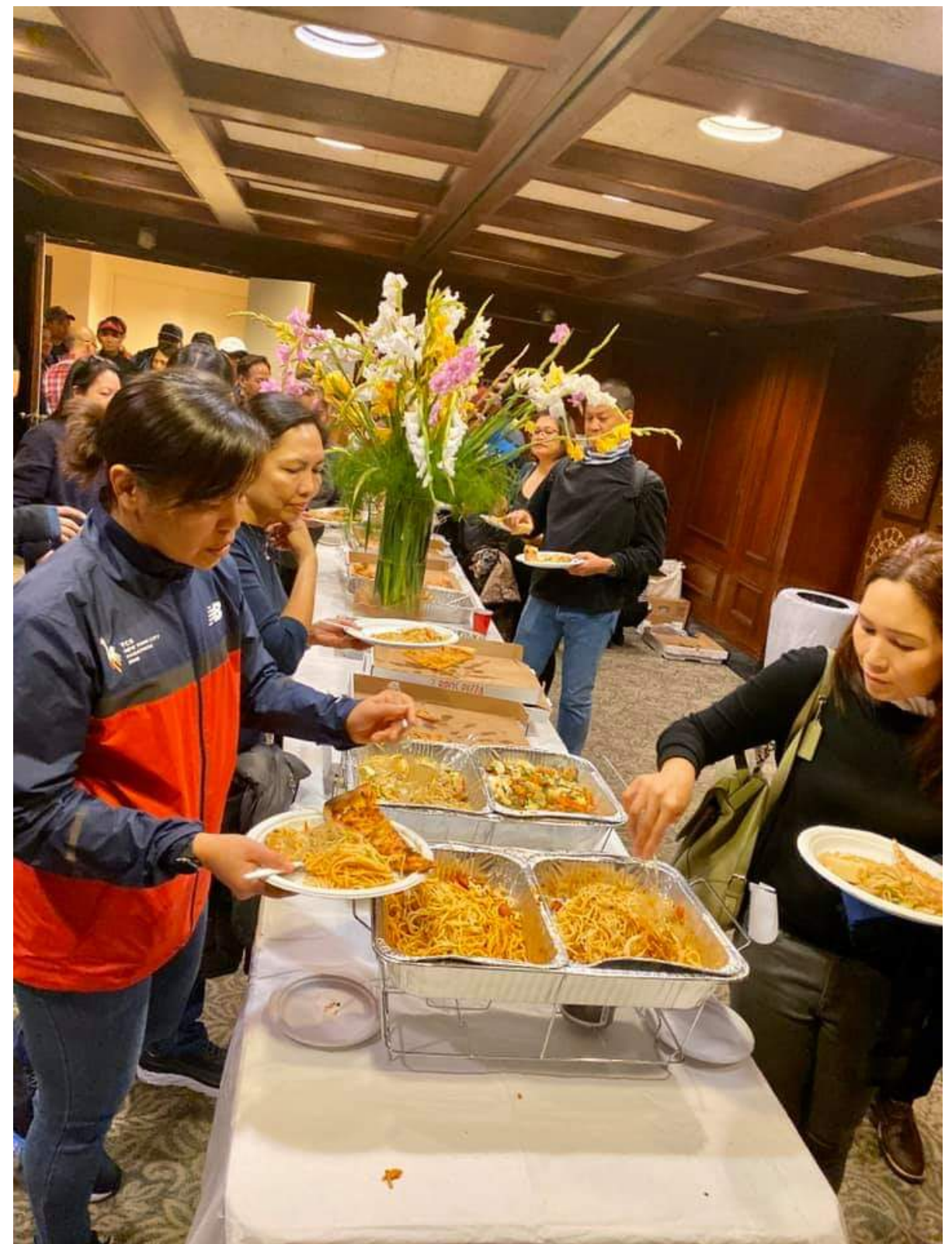
Runners fill up on carbs before Sunday's big race.