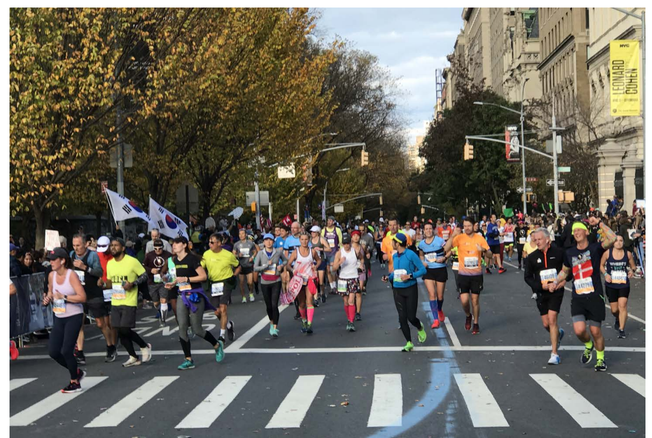
Runners from all over the world make their turn for the final miles.