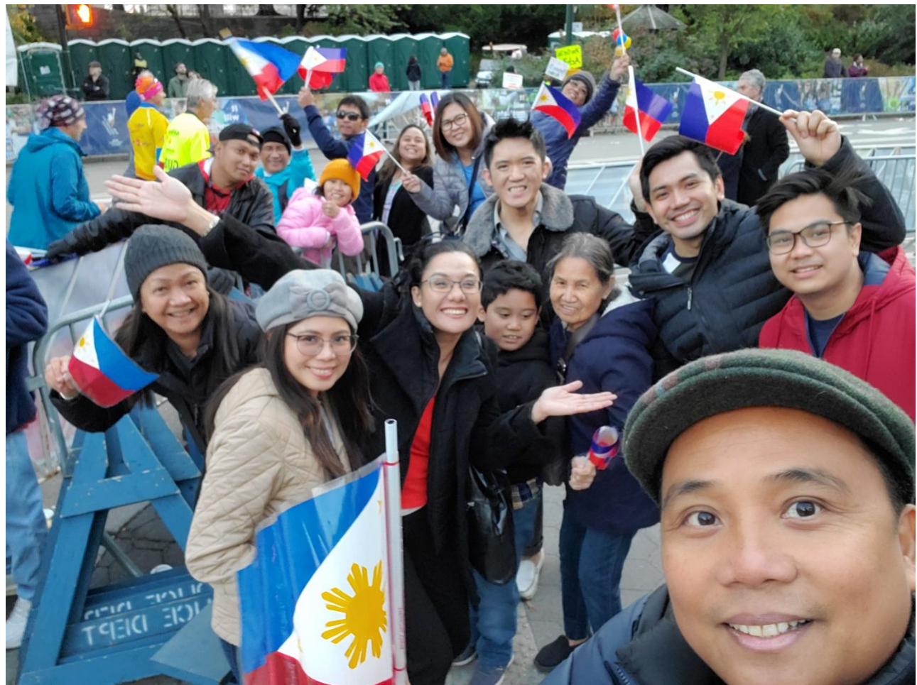
Consulate staff and members of the Filipino community cheer on the runners as they approach the final 3-mile stretch.