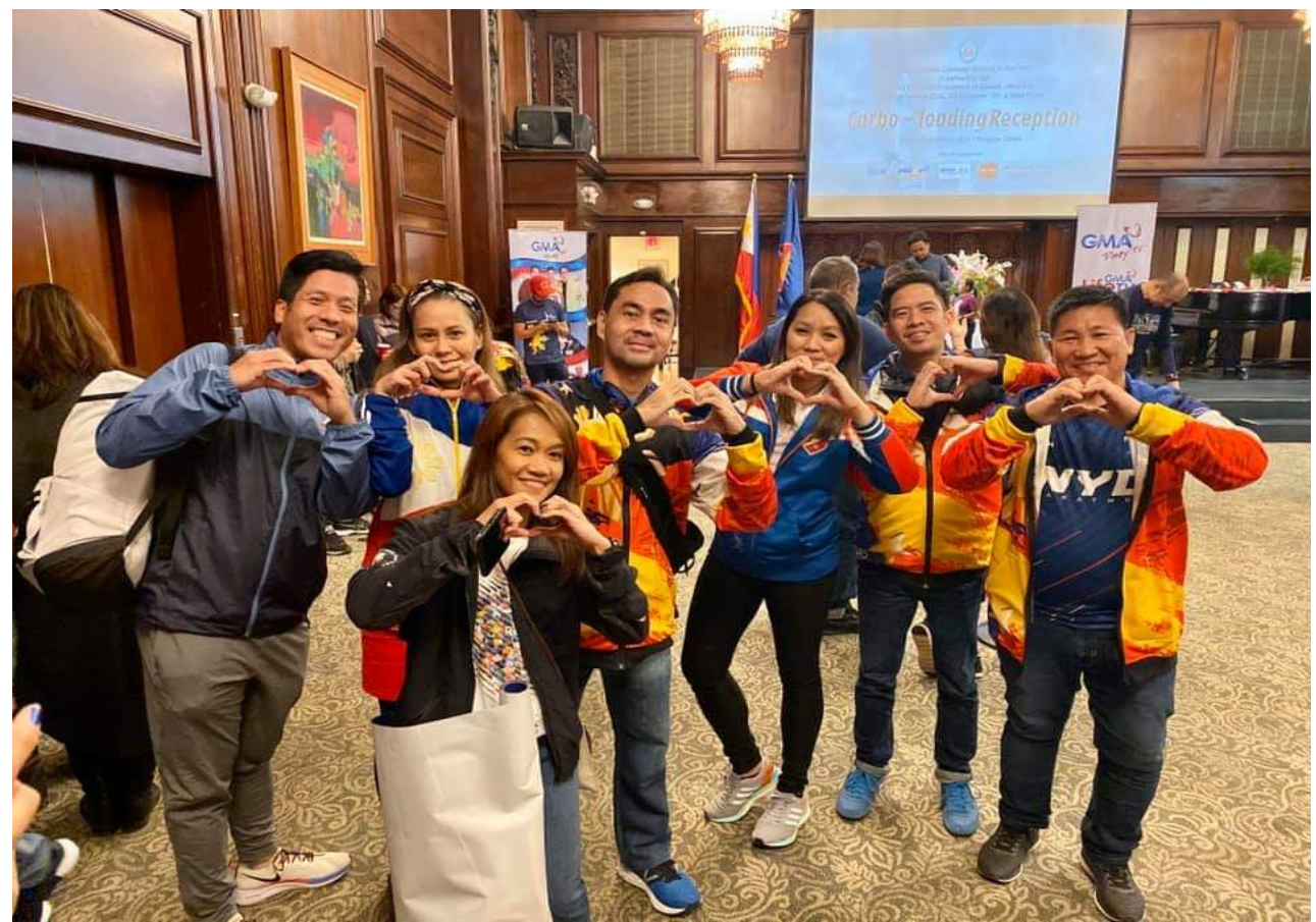
All smiles for the camera during the carbo-loading event.