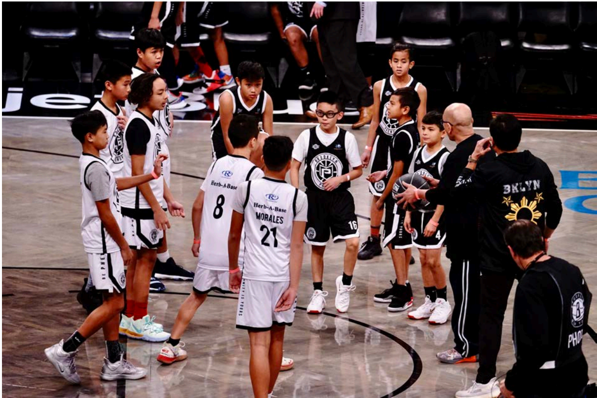
Halftime game between FABLI, JSAG, NJ Ballers and FALCON young Fil-Am