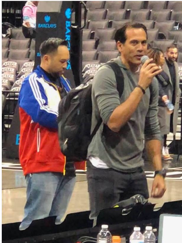
Filipino American Miami Heat Coach Eric Spoelstra greeted fans and supporter of the Filipino Heritage Night