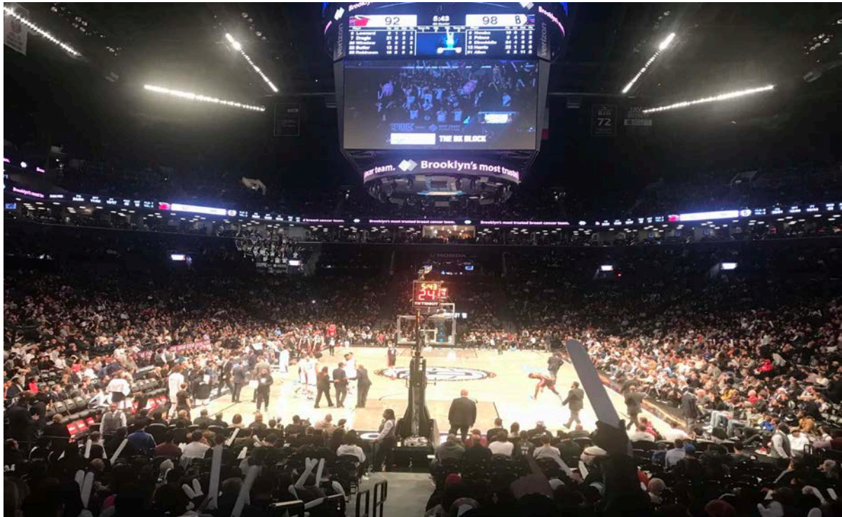
Fil-Am community members participate in the Filipino Heritage Night at Barclays Center, home of the Brooklyn Nets..

3 December 2019, New York City. –Over 2,000 Filipino and Filipino-Americans from New York, New Jersey, Pennsylvania and Connecticut went to the Barclays Center to cheer for the Brooklyn Nets as it took on Miami Heat on 1 December 2019 in a game billed as 4th Annual Filipino Heritage Night.