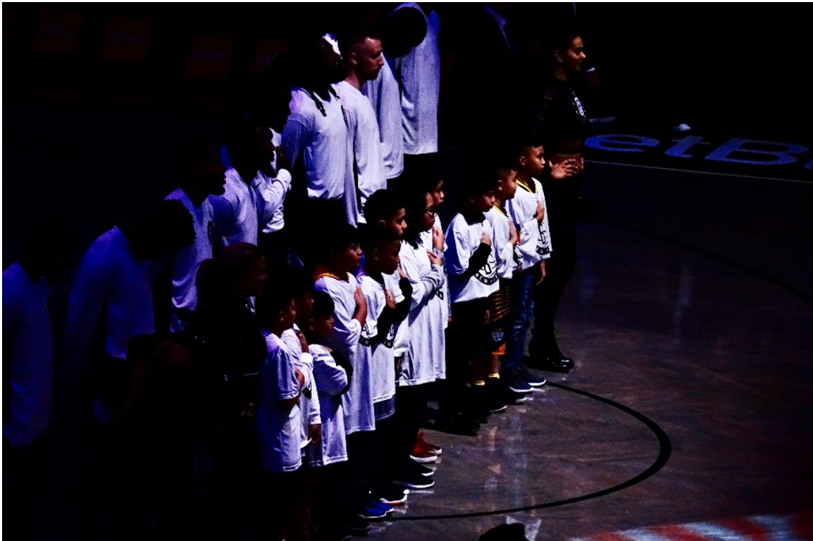
JCI NJ Youth member get to stand on the court in front of Brooklyn Nets players during the singing of the Star Spangled Banner