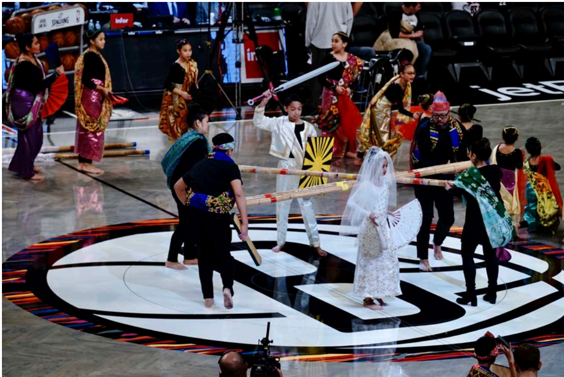
Philippine traditional "TINIKLING" dance performance from the Filipino School of New York and New Jersey.

The Philippine Consulate General in New York actively engages the Fil-Am community particularly the young generation through sports. -END