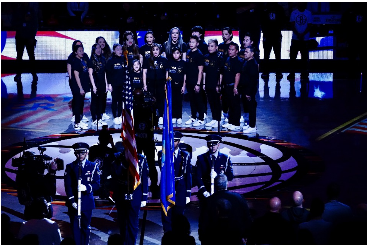
TOFA artists sing the National Anthem during the Filipino Heritage Night with the Brooklyn Nets.