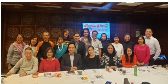
Participants of the 2 nd Gabay Mag-aaral Project Workshop, a civic project of the Homecoming sa Konsulado, held at the Philippine Center on 23 March 2019.

Members of the different alumni associations in New York and interested volunteers attended the 2 nd Gabay Mag-aaral Workshop organized by the Philippine Consulate General New York which aimed to review lessons learned and best practices in the implementation of the first Gabay Mag-aaral Project (GMP) and to plan for this year's implementation of the GMP.