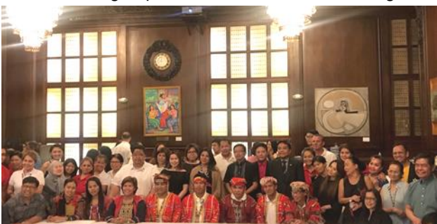
Leaders and representatives of indigenous people from Mindanao were joined by officers and staff of the Philippine Consulate and members of the Fil-Am community during the Focus group discussion held at the Philippine Center on 2 July 2019.