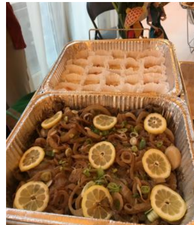
The Philippines shared its Batangas Bistek, one of the favorite Filipino ways to cook beef combining two flavors that Filipino love – salty and sour.

Each Consulate presented samples of their traditional culinary delights and drinks. This year, SOFC put into the spotlight the chefs and restaurateurs of the participating countries, giving them the opportunity to introduce the typical or traditional dishes they have prepared. The night was also a celebration of diverse culture through dance and songs participated by seven countries.