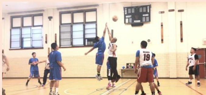
Participants playing against their coaches in 5-on-5 basketball game scrimmage

Different Fil-Am groups and organizations supported the project PHL Basketball Team, Jersey City Athletic Association, 360 Fitness, RGX Sportswear, Noodlefan, Team United, JCI New Jersey and the Pan American Concerned Citizens Action League.