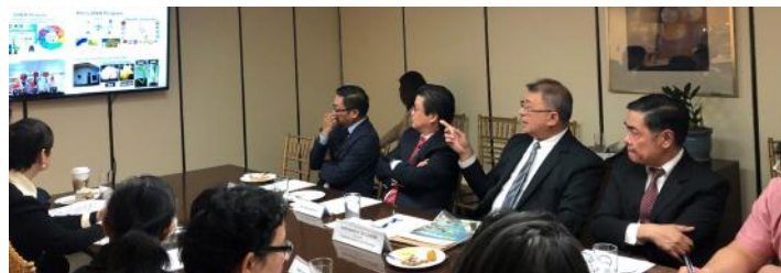
DOST Secretary Fortunato dela Peña presents several innovation breakthroughs in Philippine science and technology programs.

He presented some of the new products that came out from several DOST-funded research, development and innovation projects, such as the FDA-approved irradiated Carrageenan Plant Growth Promoter (PGP) bio fertilizer for use on rice; the Fish-i technology that uses artificial intelligence in automating fish visual census; the Automated Rapid Reef Assessment System or ARRAS, which can generate a stitched underwater imagery map at a rate of 33 km of coastline per day; the Phil-LiDAR which aims to map the country's flood hazard and major river basins to reduce disaster risks in vulnerable areas; standardized or clinically-tested herbal medicines such as Lagundi, LeptoVax, and Sambong; Biotek-M, an affordable and locally developed rapid test kit for accurate detection of dengue infection within an hour; and the Automated Guideway Transport (AGT) and Hybrid Electric Road Trains, among others.