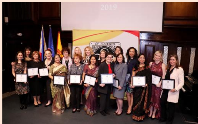
Nineteen (19) women achievers representing 19 nationalities (sans honoree of Poland) in New York were recognized at the annual event organized by the Society of Foreign Consuls (SOFC) in New York on 14 March 2019 at the Kalayaan Hall of the Philippine Center.

Nineteen (19) women achievers representing 19 nationalities were recognized at the annual International Women's Day event organized by the Society of Foreign Consuls (SOFC) in New York on 14 March 2019 at the Kalayaan Hall of the Philippine Center.