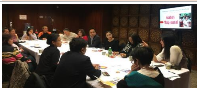
2 nd Gabay Mag-aaral Project Workshop, a civic project of the Homecoming sa Konsulado, was held at the Philippine Center on 23 March 2019.

(Continued from page 23... Gabay-Magaaral Project)