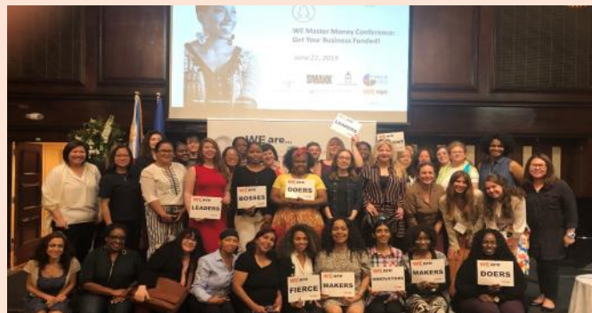
Women participants during the We Master Money Conference held at the Philippine Center New York.