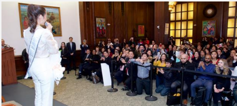
Ms. Universe 2018 Catriona Gray gamely joins the Filipino-American community in New York on 4 February 2019.