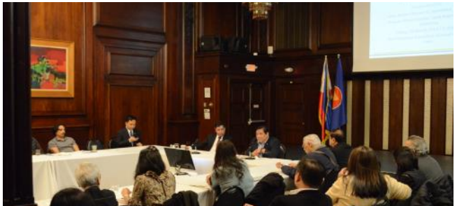
Members of the Filipino-American community raise questions on registration and transfer of certificate of title during focus Group Discussion on LRA Functions and Land Titling Updates in the Philippines.