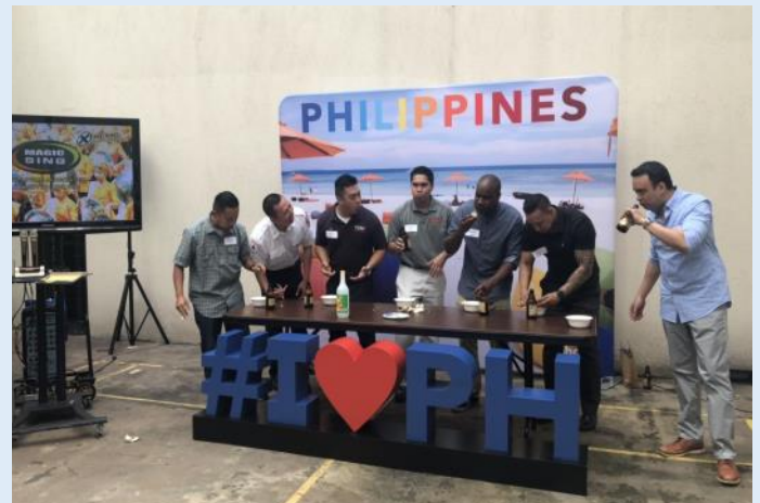
Fil-Am officers of NYPD and FDNY joined the balut-eating contest, downing two baluts with a bottle of Philippine beer.

Twenty Fil-Am officers of NYPD and six from the FDNY who are assigned in different precincts and offices in New York City participated in the gathering.