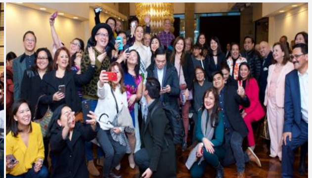
Groupie at the Lobby of the Philippine Center after the formal event