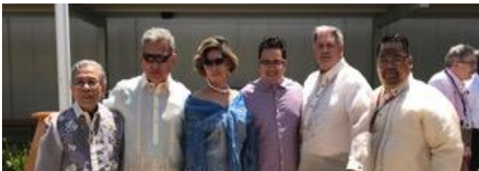
Deputy Consul General (far right) poses with local government officials and members of the Fil-Am Community.

A proclamation recognizing Philippine Independence, honoring the Filipinos' "sacrifices, hard work and contributions, here and across the globe." was presented to the Deputy Consul General.