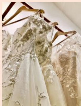
Some of the gowns displayed at CocoMelody's pop-up store in Bowery.