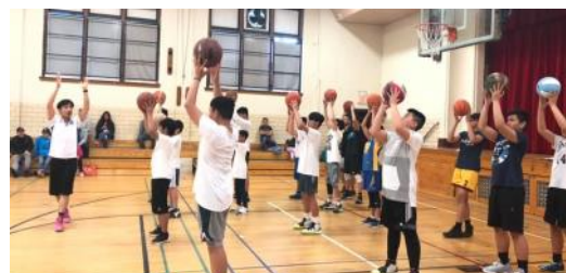
Participants, aged 10 - 12 yrs old, carrying out "ball handling drills"