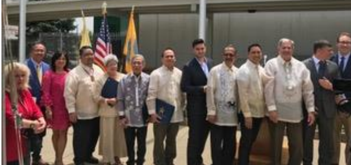
Filipinos from New Jersey Commemorate Philippine Independence Day.

Citing the contributions of the 24,000-strong Filipino community in Bergen County, New Jersey, County Executive James J. Tedesco III led the ceremonial flag raising at the Bergen County Plaza on 12 June 2019.