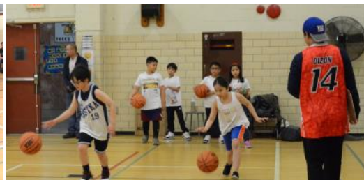
Participants, aged 9yrs old, doing dribbling drills while being supervised by the assigned Coach