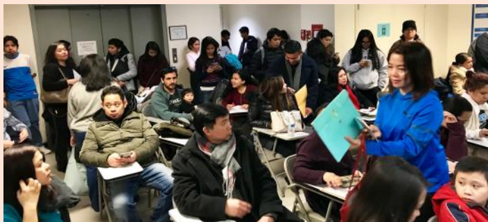
The 1st batch of customers arrives at the Philippine Consulate General.

The Philippine Consulate General in New York held its 1 st Consulate Saturday for the year on 09 February 2019.