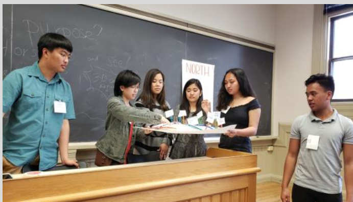
The participants present their ideal Philippine Cultural Center design which they designed as part of a workshop activity.

(Continued from page 26... HS Leadership Workshop)