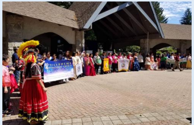
Filipinos from all over the New England area gather together to celebrate Philippine Independence.

PAMANA's commemoration of Philippine Independence will culminate with the Gala Ball to be held on 29 June 2019.