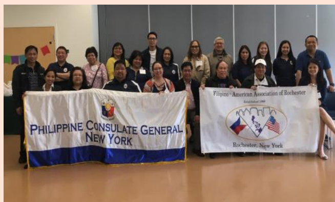
(Left):: Philippine Consulate Team members with the officers of the Filipino American Association of Rochester.

The Philippine Consulate General in New York, working together with the Filipino American Association of Rochester (FAAR), and the Albany Medical Center held the second and third Consular Outreach missions for the year on 13 and 14 April 2019 in Rochester and Albany, New York, respectively.