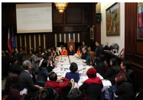
During breakout sessions, Deputy Consul General facilitates discussions on broadening involvement in local community building and socio-political processes.