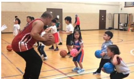
Participants, aged 3 - 4 yrs old being taught on basic stance

The Basketball Clinic will ran every Sunday of the month of May from 1:00 to 3:00 p.m.