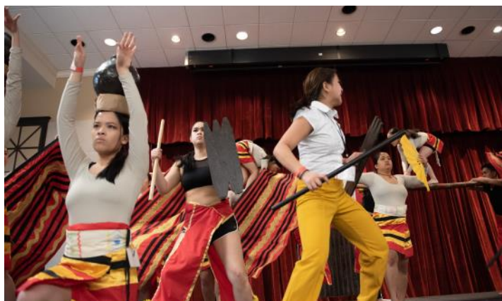
Participants use their creativity and talent in highlighting social issues and their identity as Filipino Americans during the Battle of the Barrios.